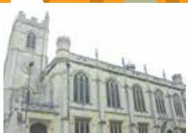
Christ Church Julian Rd Bath BA1 2RH