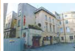
The Little Theatre St Michaels Place Bath BA1 1SG