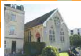
Chapel Arts / Cafe Lower Borough Walls Bath BA1 1QR