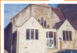
Rondo Theatre St. Saviours Rd Bath BA1 6RT