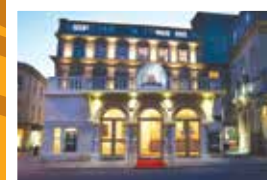
the egg Monmouth St Bath BA1 2AN