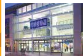
ODEON Bath Kingsmead Leisure Complex, James St W, Bath BA1 2BX